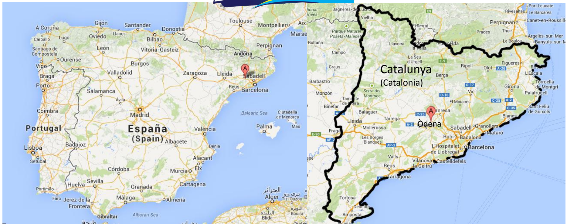
MAPA DE SITUACIÓ